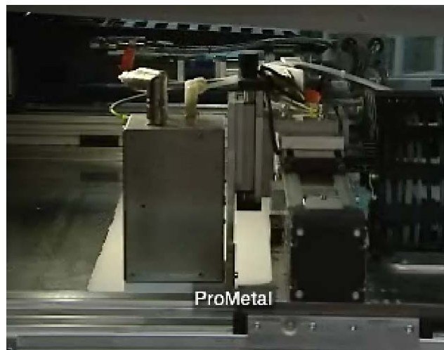
Fig.3. Pro-Metal System.

The Pro-Metal System is also used to create metal models by using inkjets to apply a liquid polymeric binder onto a powder media. Models had built from steel-based powder from the bottom up. When the model is finished, they are sintered to remove the binder, then infiltrated with bronze to either eliminate or significantly reduce porosity. Models are of high strength with no support structures needed. Tooling for plastic molding is a common application.