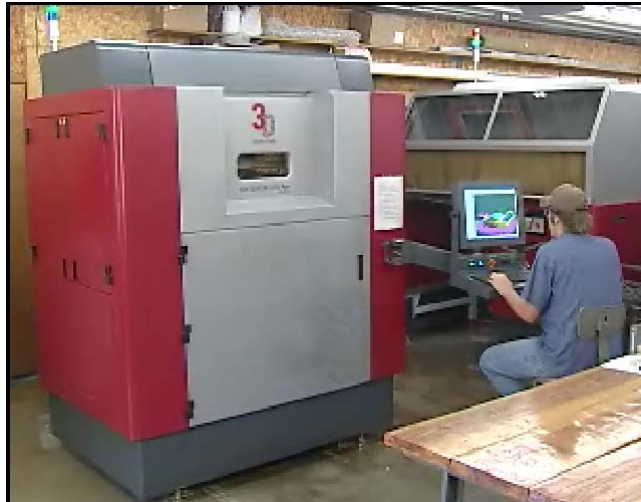
Fig.1. Installation for rapid prototyping.

The rapid prototyping presents certain advantages such as: