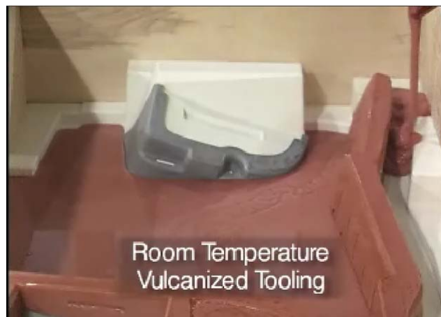
Fig.4. Room temperature vulcanizing tooling.

Room Temperature Vulcanizing Tooling produces soft tooling for low-pressure injection molding. Silicone materials are used to produce tooling since they do not require special curing equipment.