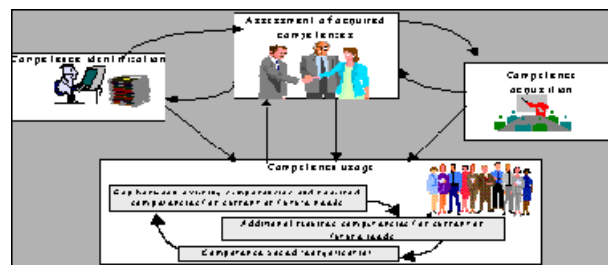
Figure 1: Competence Management Process Architecture

To support these processes, in our previous work on competence management Competency Resource Aspect Individual (CRAI approach) , we have used the classical techniques for the design and the implementation of information systems (mainly database technologies and related design methodologies ).