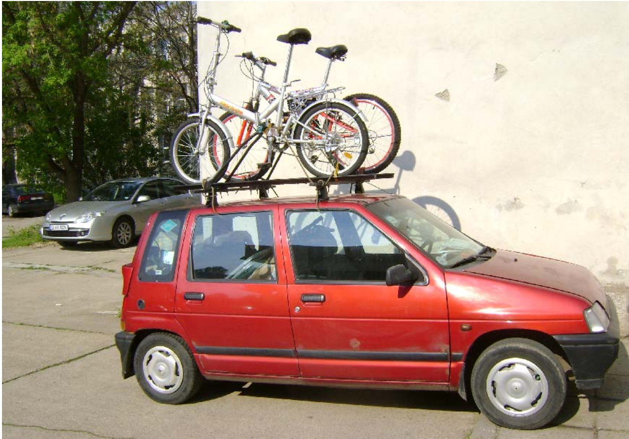
Fig.2. The two bicycles installed on the roof of the automobile

The roof-rack and the two bicycles were secured with a synthetic rope tied to the inside passenger handles in order not to be thrown away at high speeds. Obtained data are important as in sport events like Tour de France same system is used to carry spare bicycles for the riders.