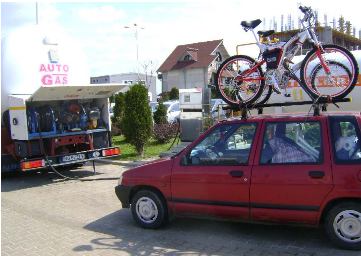
Fig.3 Fuelling of the fuelling pump in Pitesti

In Fig.3 it is presented the fuelling of the fuelling pump by a specialized truck in Pitesti.