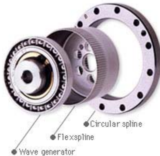
Fig. 1 Component parts of a harmonic drive (according to www.hds.co.jp [4])

The functioning of these transmissions, their principle of motion, is well represented in the figure 2 (according to the Harmonic Drive Systems Inc. - www.hds.co.jp [4]).