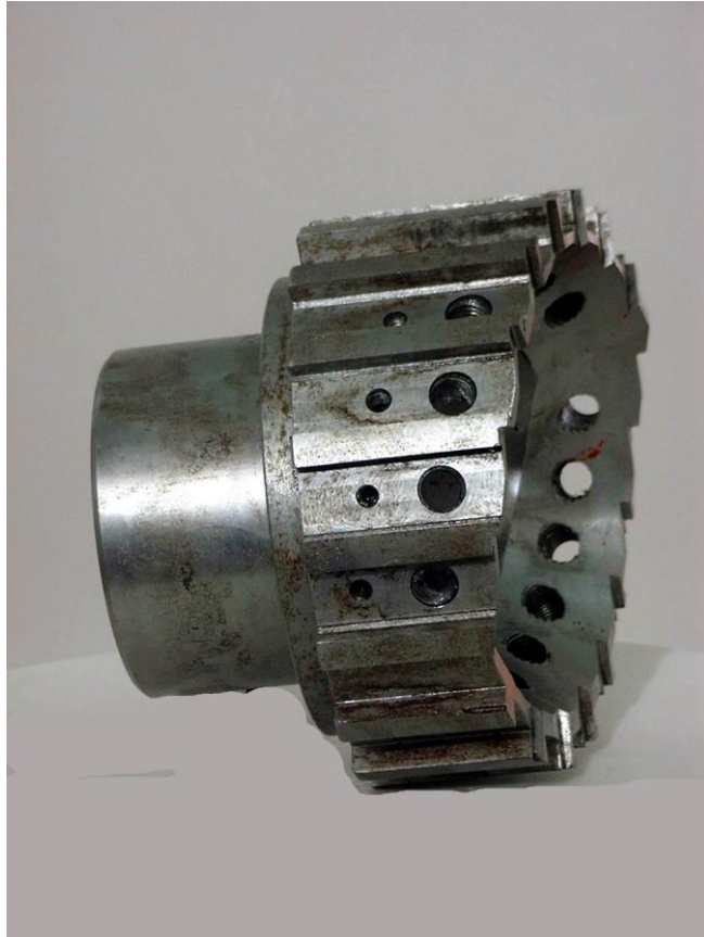
Figure 2. Technological device done

The body of the device, figure 2, is manufactured on classical machines, for milling the channels it is used a dividing head. The division of the body (no. of channels) is done so that the distance between the channels to be a minimum, leaving space for buffering of the raising of the profile.