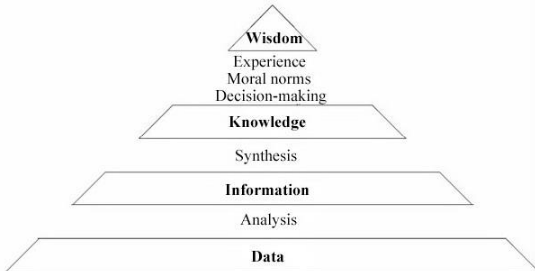
Figure 2. Overview of relations [13, 14]

within knowledge management help the organization to focus on acquisition, preservation and use of knowledge for problem-solving, dynamic learning, strategic planning and decision-making.