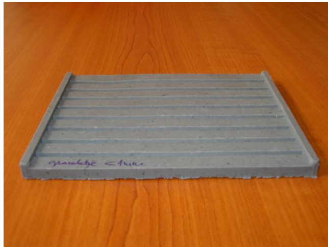
Figure 2. Antivibration insulating mat used in railway transport command systems