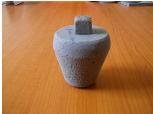
Figure 3. Antivibration insulating element

There were employed surface structure and characterization techniques such as SPM (Scanning Probe Microscopy) and nano-indentation using a nano-mechanical characterization G200 equipment (Agilent Technologies) in different modes. The device offers ISO 14577 compliant nano-indentation methods, which makes it suitable for industrial applications as well (figure 4).