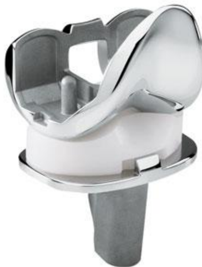
Figure 4. Complete implant, Zimmer_NexGen

Among the selected patients 74,3% were obese (grade II and III, according to the IMC).