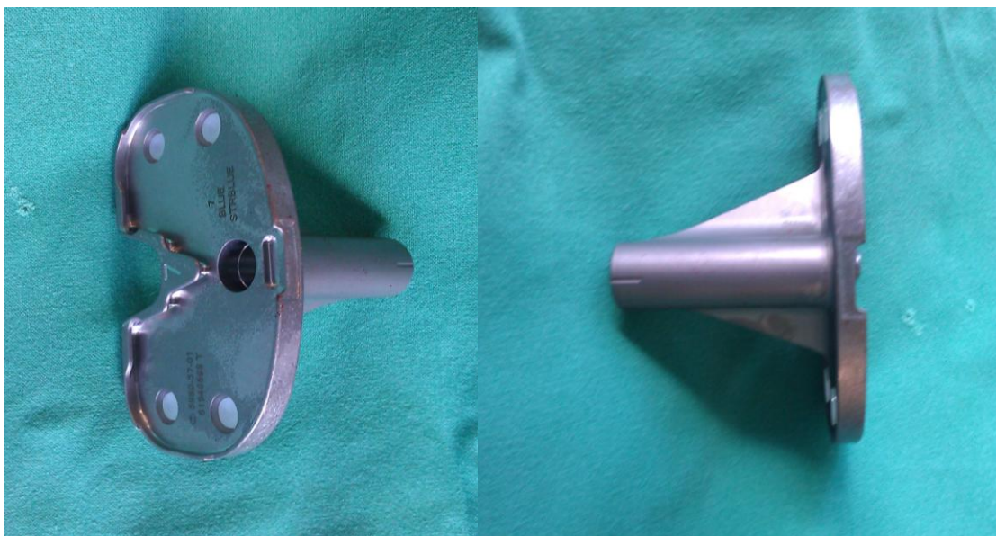
Figure 2. Tibial component

The tibial component, made of titanium alloy, respects anatomical shape of the tibia and is universal left / right. The design allows flexion to 130°. Tibial component presents the opportunity for suprastabilisation and transformation in revision prosthesis by attaching the extension rods, depending on the intraoperative needs. It presents a great modularity, extreme sizes of the tibia and femur can be combined together, keeping joint congruency, such as one size of the femur can be combined with 8 sizes of tibia. It presents peripheral attachment system of the polyethylene insert to the proximal side; the implant surface is matte and the modality of implantation is cemented. The sterilization is performed with Gamma radiation.