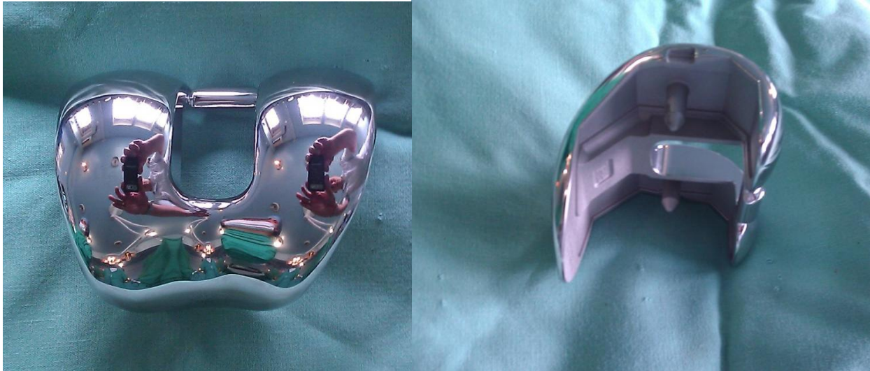
Figure 1. Femoral component

The tibial component, made of titanium alloy, respects anatomical shape of the tibia and is universal left / right. The design allows flexion to 130°. Tibial component presents the opportunity for suprastabilisation and transformation in revision prosthesis by attaching the extension rods, depending on the intraoperative needs. It presents a great modularity, extreme sizes of the tibia and femur can be combined together, keeping joint congruency, such as one size of the femur can be combined with 8 sizes of tibia. It presents peripheral attachment system of the polyethylene insert to the proximal side; the implant surface is matte and the modality of implantation is cemented. The sterilization is performed with Gamma radiation.