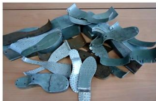
Fig. 3. Modular mould for direct soling injection. Solution 1.