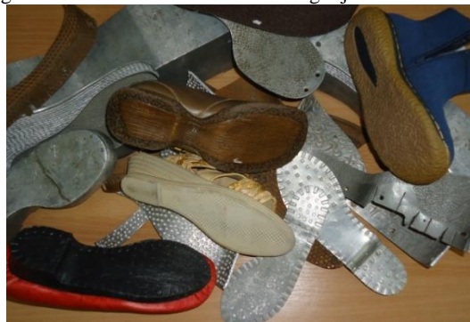
Fig. 4. Soles injected using a modular mould. Solution 1.