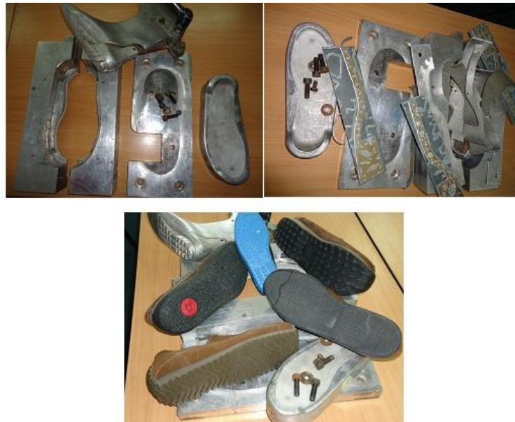
Fig. 5. Modular mould for direct soling injection. Solution 2.