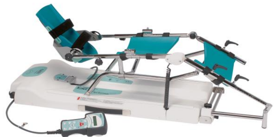
Fig. 2 – Commercial example of CPM machine (Kinetec Performa knee CPM) [15]

The method of rehabilitation with the use of the CPM device affects the acceleration of the process of post-operative knee rehabilitation after arthroscopy and arthroplasty. It allows, among others, the improvement of metabolism within the joint, accelerates healing of damaged parts of the joint and reduces increased soft tissue tension. Furthermore, one can observe a faster absorption of hematoma, a better blood supply to the limb and increased strength of the ligament tension.[14]