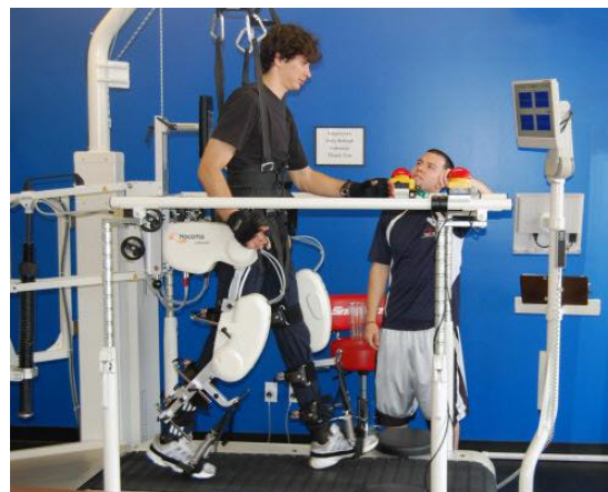
Fig. 1 – Lokomat therapy robot [7]

The use of robots in rehabilitation is often associated with assistive devices, some used in special dedicated areas, some as aids to daily living. There are some other areas where robotic technology has been applied such as in mobility, where traditional wheelchairs, prosthetics and orthotics are being developed to increase the usefulness. A major area of concern is represented by the robot mediated therapy, where robots are used to increase the effectiveness of traditional therapies and even to develop new therapy protocols.