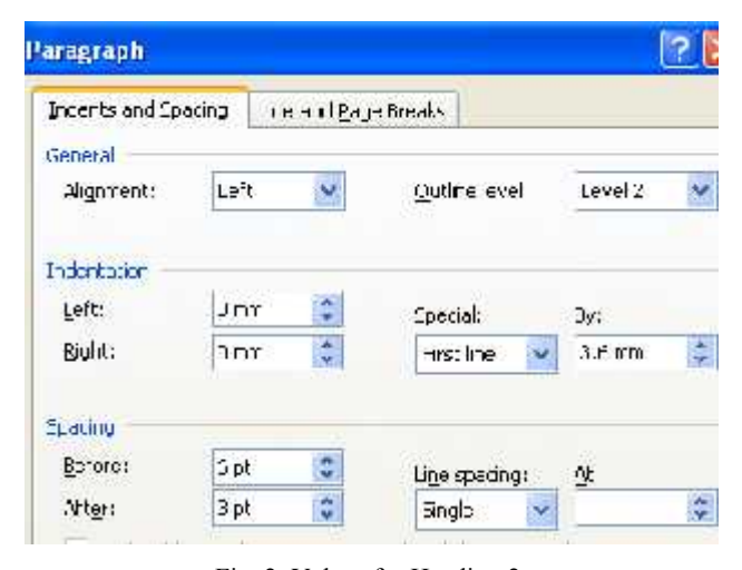
Fig. 2. Values for Heading 2

Choose Paragraph: Values should be as in Fig. 1.