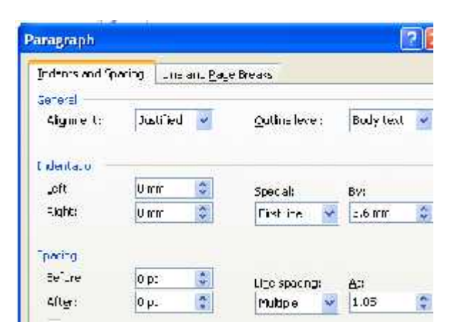
Fig. 1. Values for text

11) Heading 1: Times New Roman, 10 pt, Centered